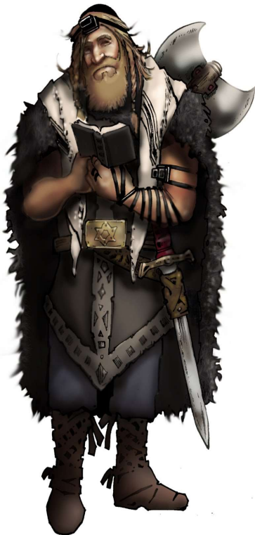
A Jewish Viking